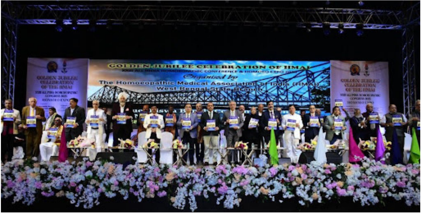
Release of Souvenir at the Inaugural session

The Homoeopathic Medical Association of India (HMAI), the largest homoeopathic association in the country and one of the institutional member of Liga Medicorum Homoeopathica Internationalis (LMHI) celebrated its Golden Jubilee with the 23rd All India Homoeopathic Congress and Homoeo Expo 2025. The event was held from 26th to 28th December 2025 at the Biswa Bangla Convention Centre, Kolkata, West Bengal. The theme, “The Symphony of Homoeopathy in Health Care: Harmonising Research and Practice,” reflected the Congress’s vision of integrating scientific inquiry with clinical excellence, while strengthening Homoeopathy’s role in national and global healthcare frameworks.